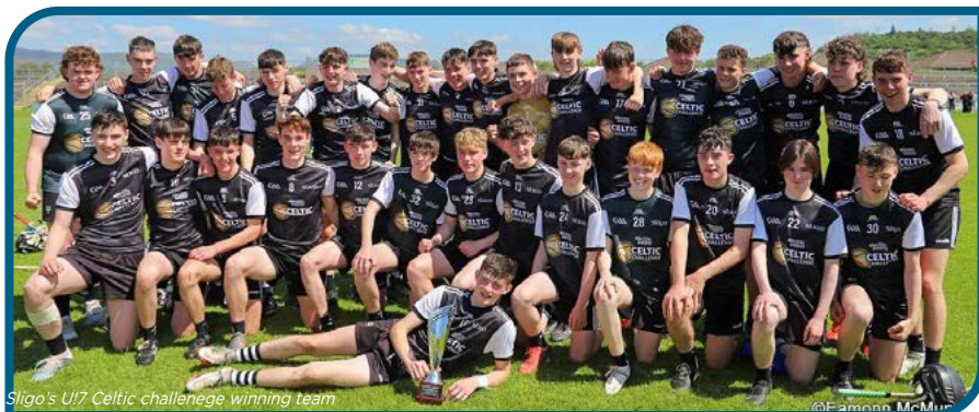
Sligo's U17 Celtic challenge winning team