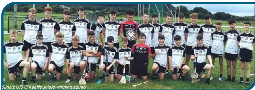
Sligo's U15 O'Keefe shield winning squad