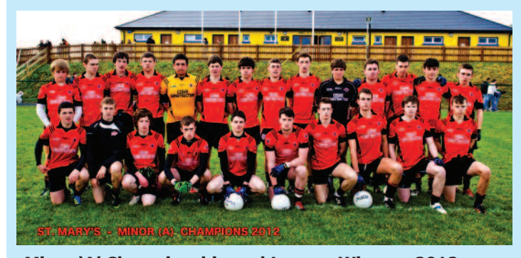
Minor 'A' Championship and League Winners 2012