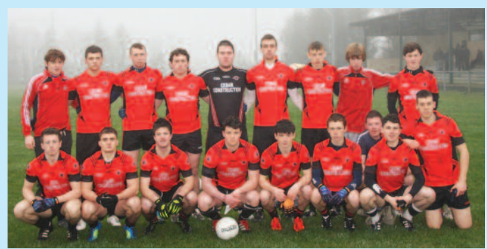
U20 'A' Championship Winners 2012