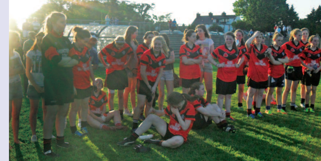
U16 Girls 2012

will to win the Junior Championship in 2013.