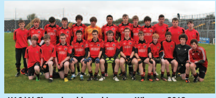
U16 'A' Championship and League Winners 2012